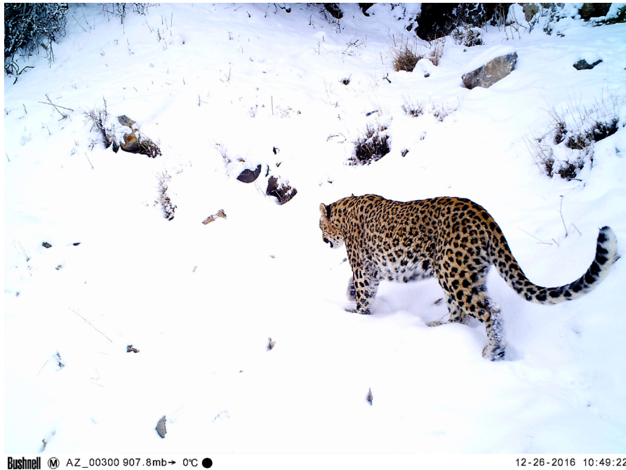
Leopard in Nakhchivan/Azerbaijan, Dec 2016